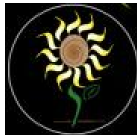
Sunflower Photo Show Photographer